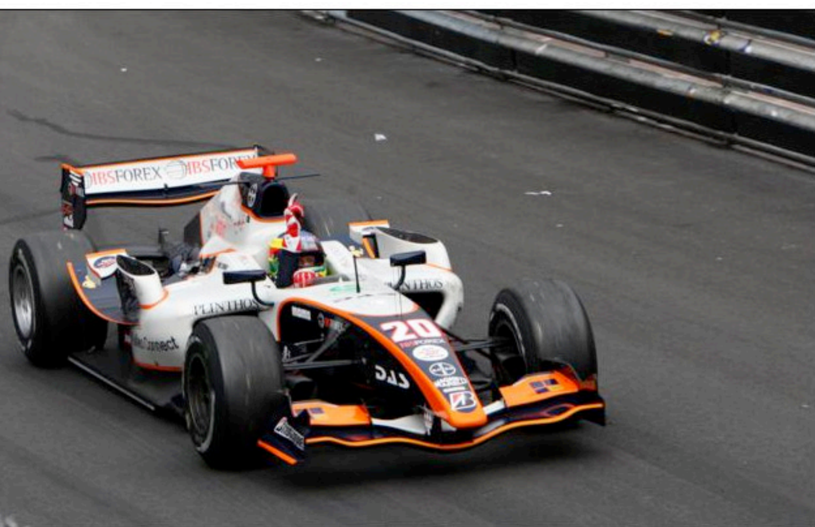
ON THE CREST OF A WAVE . . . Mike Conway salutes the crowd after his dominant win at Monaco